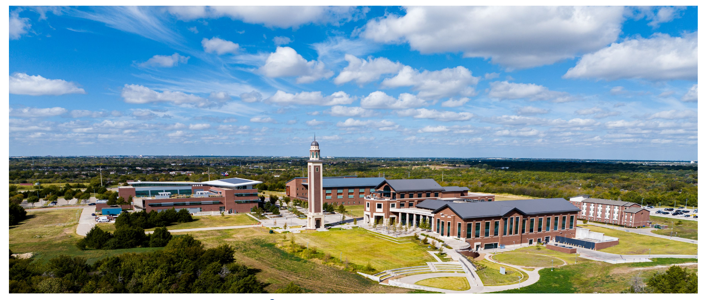
Questions & Answers